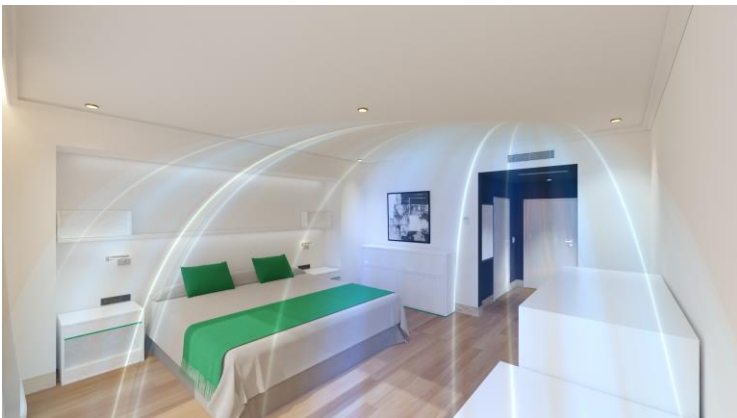
SCHAKO AQSH flow pattern