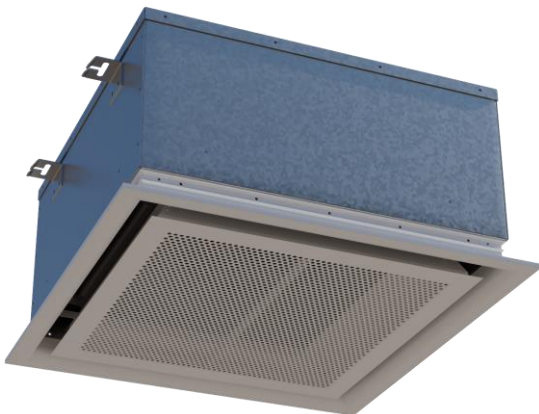
SCHAKO UKGW cassette