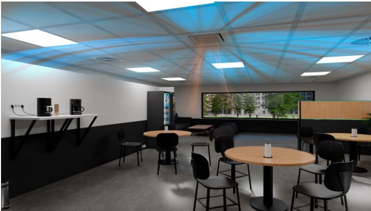
SCHAKO UKGW cassette flow pattern